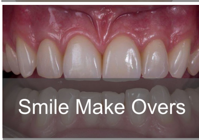
Smile Make Overs