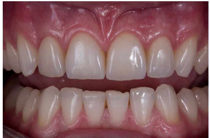
After - Award Winning Smile Makeover